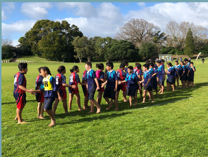
Auckland Rugby League Tournament.