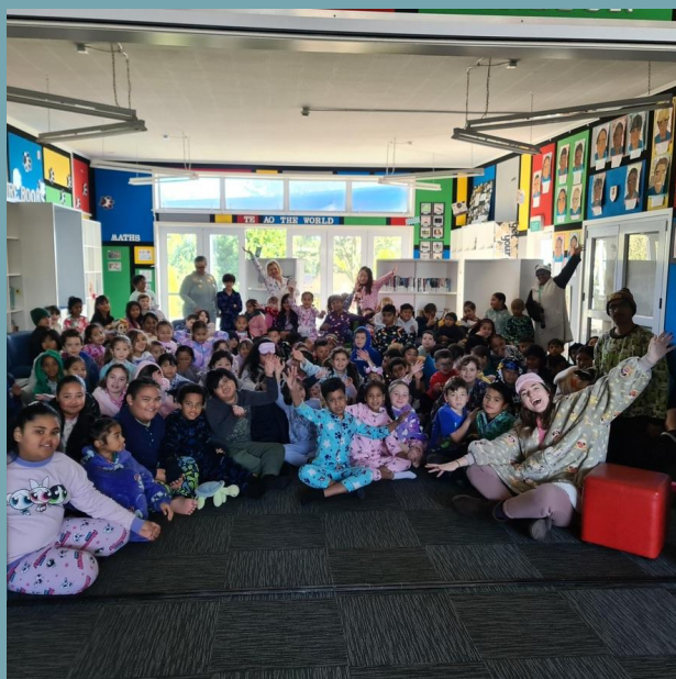
The Rata Team - Pyjamas and a Movie Day was great fun.