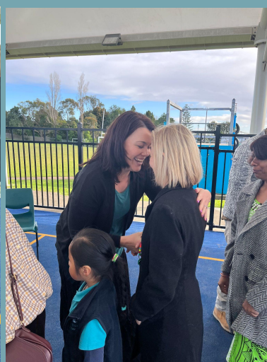
Pōwhiri to welcome new students and staff.