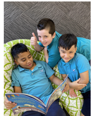
Buddy Reading with Rata Children

In Reading, we continue to take an interest based approach catering to the mixed abilities in the classroom. The children read daily in the classroom and will have a book to further read at home. In addition to class books, we encourage all the children to read for pleasure, and our visits to our school Whare Ahuru Mowai will further support this.