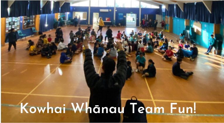
Kowhai Whānau Team Fun!