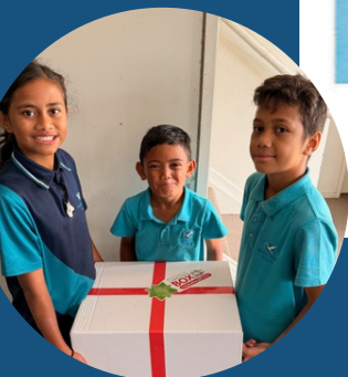
BAILEY ROAD SCHOOL ABOVE AND WITHIN EXPECTATION PROJECTIONS 2026-2029